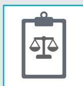
RISK AND COMPLIANCE